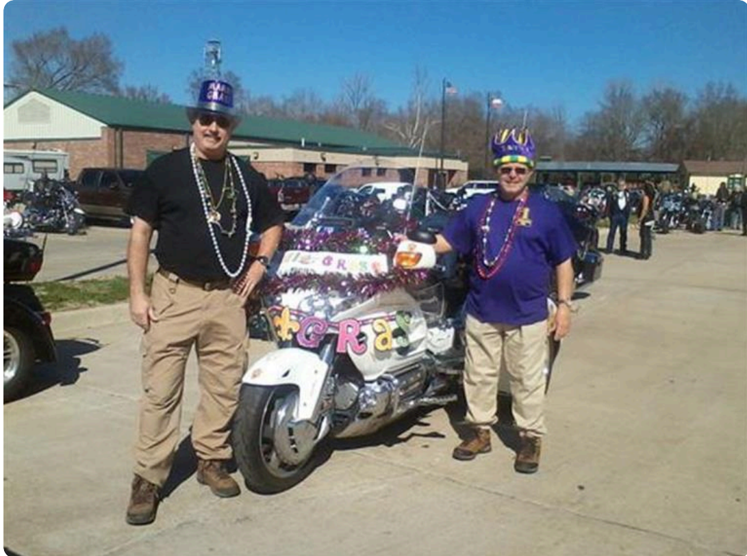
Mardi Gras Parade Jefferson, TX